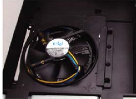
Before: Previous Design